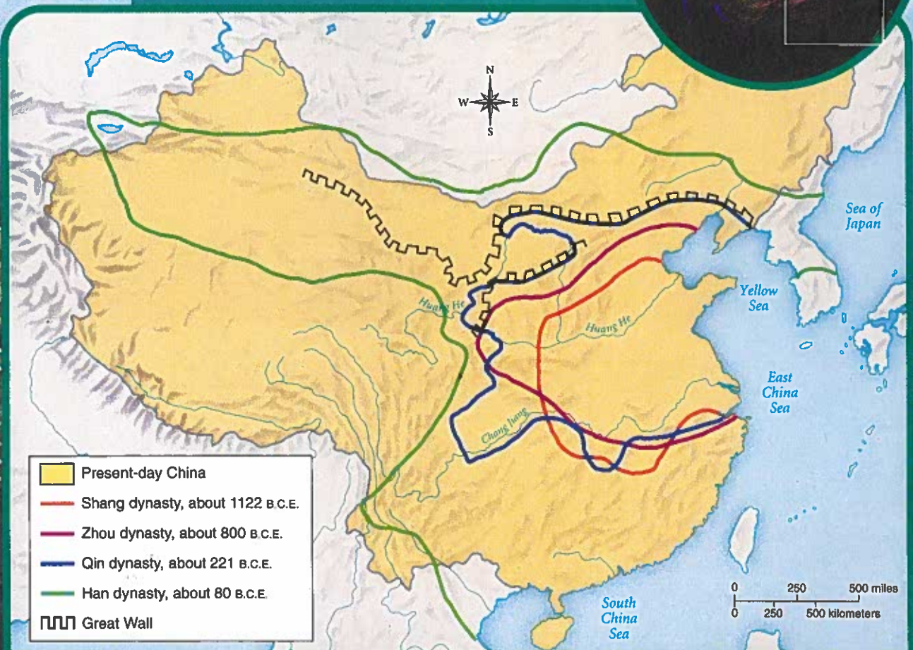
Areas Controlled by the Four Dynasties of Ancient China