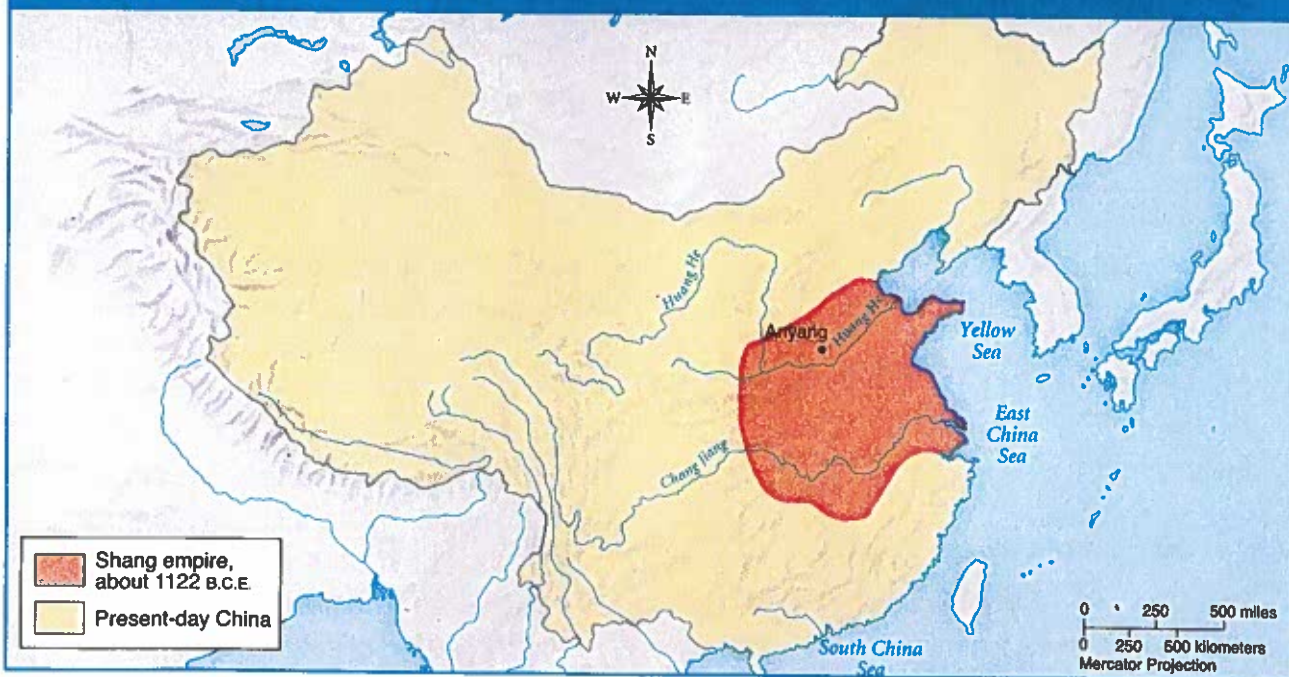
The Shang Empire, About 1122 B.C.E.

clan a large group of friends and family